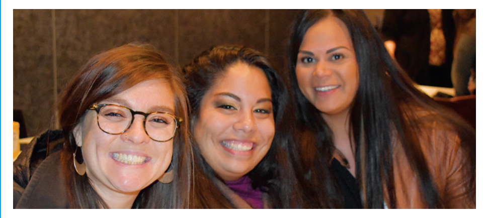
SOS Illinois Case Management and Clinical staff gathered in October for a special recognition luncheon

At SOS Children's Villages Illinois, the success of our community is the result of many hands and much hard work. Our Case Management and Clinical team provide compassionate support and advocacy for the children in our care as they transition into our Villages, navigate the Illinois court system, and make strides towards permanency.