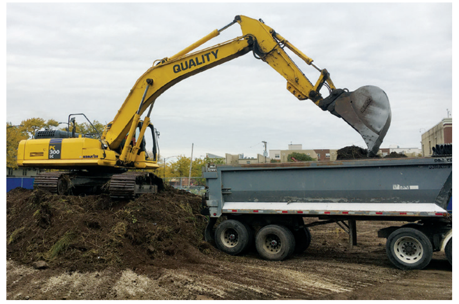
Ongoing construction of the Roosevelt Square Community Center during fall 2019

To contribute to the project, please visit us online at sosillinois.org or contact our Development Department at 312-372-8200.