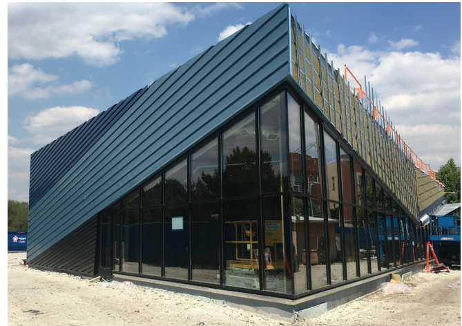
External construction as of June 2020.

Additionally, exterior framing and metal panels, as well as windows for the entire building have been framed and installed; thus, the structure is now fully enclosed. The immense work that has been completed has set the Roosevelt Community Center right on target for the center's completion and opening in late September 2020. A special thanks to the leadership of Lendlease for keeping use on track.