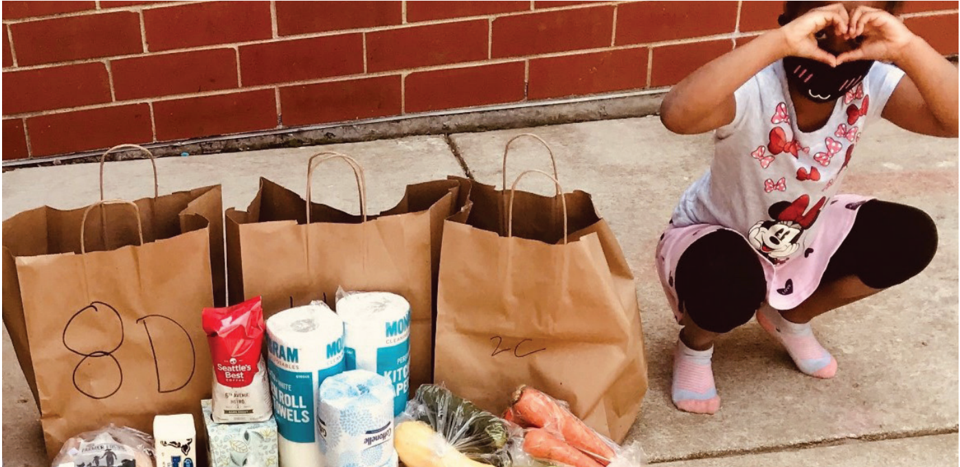
A child at SOS Illinois stops for a loving pose with groceries delivered by Swissôtel Chicago

Over the course of three short months, SOS Children's Villages Illinois has faced myriad new and unexpected challenges as an organization caring for at-risk youth and children in foster care. As the "stay at home" order was put in place due to COVID-19, we were grateful our services were deemed essential; and therefore, continued without interruption. However, the very idea of going full speed ahead, when most of the population of Illinois was asked to shelter in place, easily could have seemed an overwhelming task.