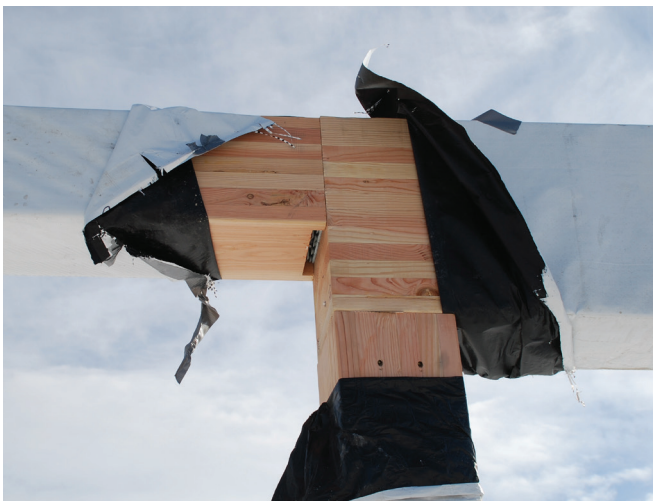
Sustainable cross laminated timber and Glulam columns being unwrapped.

Designed by architect Juan Moreno and JGMA with construction led by Lendlease, this Center is located at 13th Street and Blue Island Avenue in the Roosevelt Square neighborhood of Chicago. Once opened, the Center will serve over 5,000 individuals and families from the Roosevelt Square Village and surrounding communities through services for children and adults alike, including a full teaching Culinary Kitchen.